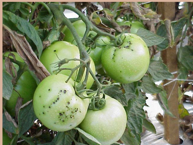
Figure 13. Bacterial spot on tomato can easily be spread within the field when plants are wet when handled.