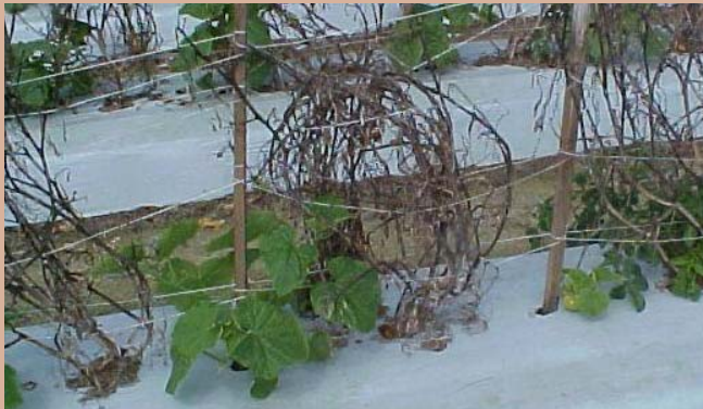
Figure 14. Make sure tomato plants are completely killed, especially if double-cropping is planned as shown in this photograph of cucumbers planted following tomatoes. The stakes and strings are left to provide support for the cucumber vines. Trellising improves fruit quality and reduces disease.