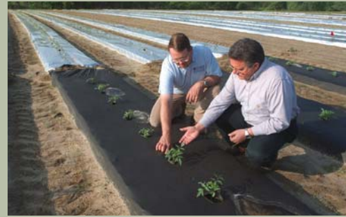
Figure 3. A variety of tests for mulches has been done to find the efficacy of the different colors on insect control.

Polyethylene mulch has been used in vegetable production for over 40 years and is currently used in virtually all pepper and tomato production in Florida. Mulches vary in thickness and color, with white being used in hot seasons and black in cool seasons. Colored mulches have been tried for insect control with varying success. More recently, use of virtually impermeable film (VIF) has gained in popularity. In addition to being an integral part of fumigation success, mulch can increase yield, inhibit weed growth, improve moisture retention, reduce crown fruit rot and reduce fertilizer leaching.