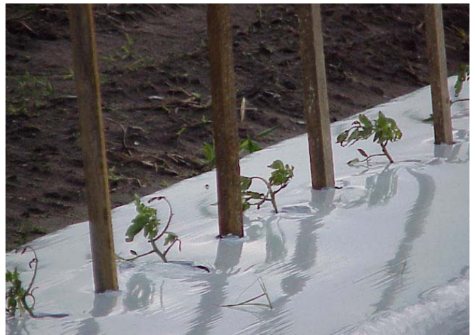
Figure 22. Wind can desiccate plants and wind-blown sand can abrade young seedlings, causing loss of foliage and crop delay or even death. Tomato stakes can actually help protect young plants if wind is blowing down the row instead of across the row.