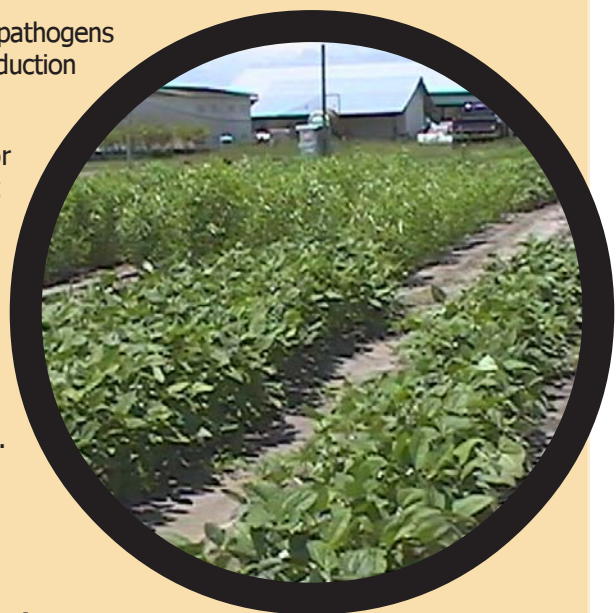
Figure 16. 'Iron-Clay' pea cover crop.