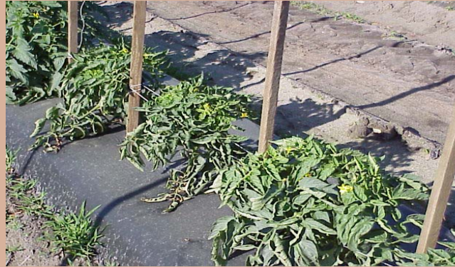
Figure 6. TYLC symptoms on tomatoes in central Florida.