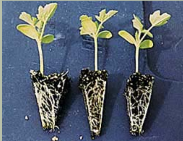
Figure 9. Healthy tomato transplants.

Virtually all of the tomato and pepper acreage in Florida are planted using transplants or plug plants to promote earliness, uniformity and decrease disease problems. Planting dates are based primarily on marketing and economics. This decision is driven by anticipated "market windows" when crops are predicted to be of higher value for a given area. Within this general category there are also a number of other related factors which should also be taken into consideration to maximize production during any chosen planting period.