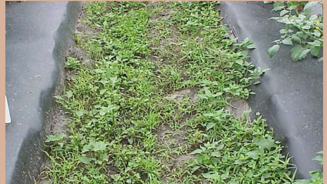
Figure 15. A variety of weeds growing in tomato row middles can serve as hosts for crop pest problems. Knowing the weeds present in a field can help with selecting the best control materials for the future. Remember that weeds can also be hosts for nematodes.