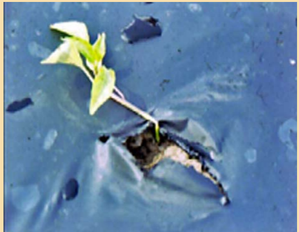
Figure 10. 'Heat girdling' or 'stem scalding' resulting in stem collapse of pepper. Transplanting at 11 am and 1 pm resulted in a 20-30% increase in heat girdling compared to 9 am and 3 pm.