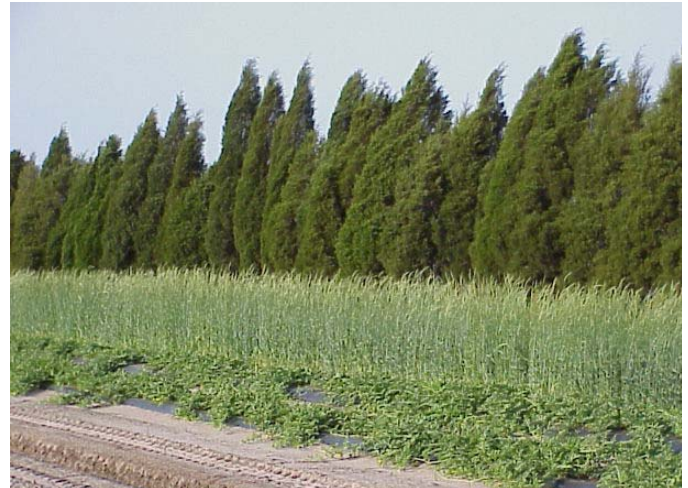
Figure 21. Here, rye is planted as a temporary windbreak on ditch rows within the field and southern red cedar is planted on individual field borders as a permanent windbreak.