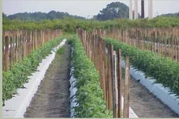
Figure 12. Good field sanitation, such as keeping the row middles free of weeds, can limit the number of pests and pathogens on your field.

Good field sanitation practices are becoming more important pest management tools due to the loss of pesticides with fewer new products coming in, and the reduction in efficacy due to resistance problems. Field sanitation practices should be an important aspect of production from field preparation through harvest and beyond.