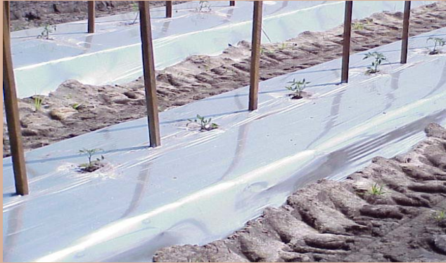
Figure 5. Metalized VIF mulch covering tomato beds in central Florida.

In the spring crop of 2000 in North Florida on a large scale grower trial (40 acres metalized and 100 acres black), use of metalized mulch reduced incidence of TSWV from 45% to 11%. In 2002 in another grower trial (100 acres metalized and 25 acres on black), the combination of Actigard® and metalized mulch reduced TSW from 23% to 3%. Other growers report reduction in virus of up to 75% with increased profits of up to $4000 per acre.