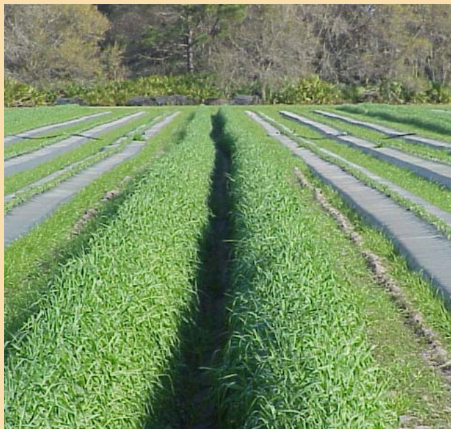
Figure 20. Windbreaks are often planted on irrigation ditches in tomato fields to protect from ‘sand blasting’ and desiccation. This is especially true in spring; however, the windbreak must be planted early enough to be taller than the crop plants they are supposed to protect. Here a shorter growing rye species is planted between rows to reduce rain splashing of soil and pathogens onto plants.