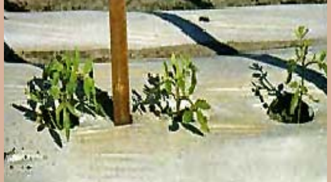
Figure 11. Varying transplant depths (left to right): to first true leaf, to cotyledons and just covering the root ball.