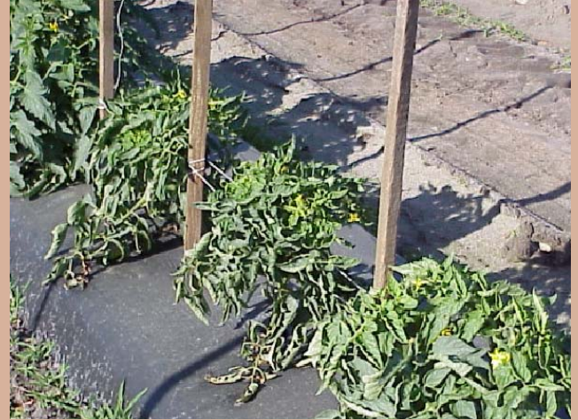
Figures 1 & 2. Cover crops are an important aspect of pre-season cultural control (left) and during the season there are many ways to manage tomatoes and peppers that reduce the incidence of diseases and keep harmful insect populations at a minimum (right).

As both the cost of pesticides and pest pressure increases, growers and consultants are looking more closely at how cultural control options will fit into their cropping systems. The major cultural controls that are covered in this chapter include: