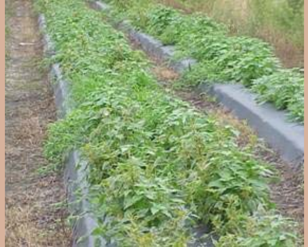
Figure 19. Heavy weed infestation in a mulched double cropped cucumber planting along with re-growth of peppers from the first crop. This situation can increase nematodes and other pests which can be carried over to the next primary pepper crop.