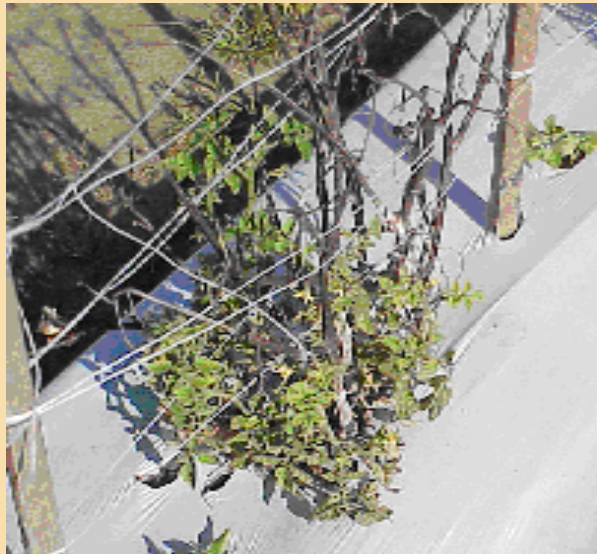
Figure 18. Tomato yellow leaf curl infected re-growth from tomatoes in a double-cropped field seeded to cucumber. Infected tomato re-growth can serve as a reservoir for virus which can then be carried to neighboring new fields. This grower resorted to hand-pulling the entire field of old tomato plants, a considerable labor expense.

With the impending loss of methyl bromide, field histories of soil borne pests, pathogens and weeds become very important for both the first and the double crop.