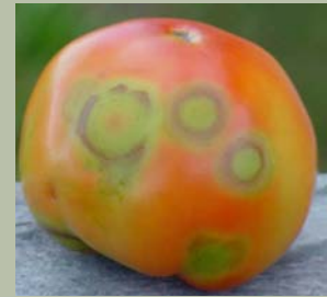
Figures 7 & 8. TSW damage on green and ripe fruit in north Florida.