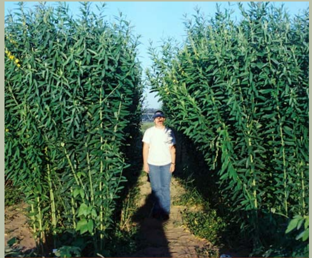
Figure 17. Sunn hemp has been shown to reduce root-knot nematode populations and enhance natural enemies. Seed may be expensive and difficult to obtain.