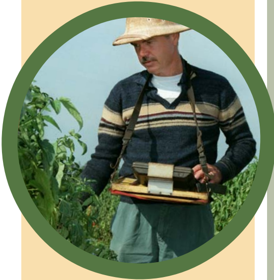
Figure 5. Regular scouting is critical when developing an IPM program.

Ultimately, the only sustainable way to protect a crop and maximize profitability is to incorporate pest management into the planning process.