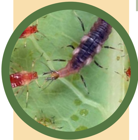
Figure 6. There are many ways to implement integrated pest management, such as using lacewing larvae to control aphids.

Greater adoption of prevention-oriented IPM practices will increase opportunities for growers to widen their options for managing pests and diseases while maintaining economic viability and reducing risks to human health and the environment.