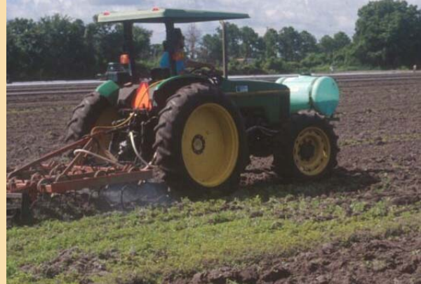
Figure 3. Cultural practices have been instituted to reduce whitefly exposure to nicotinoids, such as crop or host free periods and sod-based rotations with bahia, pangola and digit grasses. These methods, plus selected herbicides, also help reduce the impact of weeds.

None of these practices were sustainable economically or environmentally, and led to widespread resistance and crop failures. Growers could no longer rely on broad-spectrum pesticides and had to incorporate several alternative practices for pest management. They had to adopt multi-tactic, ecologically based IPM by selecting the best available technologies for reducing pest risk in their farming systems while maintaining economic viability.