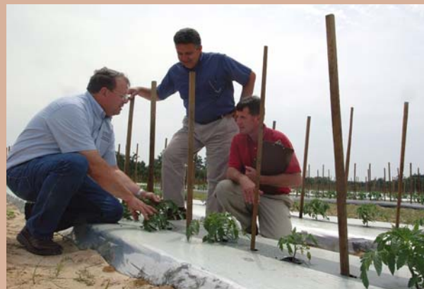
Figure 4. Research on alternatives for managing thrips and tospovirus on solanaceous crops resulted in efficacious, cost-effective, reduced-risk tactics, such as UV reflective plastic mulch that reduces the incidence of virus by as much as 75% and dramatically boosts tomato yields. Reflective mulch is being used together with the reduced-risk insecticide, spinosad that poses little threat to field workers or the environment, and a new immune-boosting treatment that induces systemic acquired resistance (SAR).

In the long term, however, chemical pest management alone does not create sustainable production systems. Consequently, extensive research and extension programs have been conducted on IPM in tomato and pepper to help growers transition away from high-risk pesticides and adopt biologically-based IPM programs.