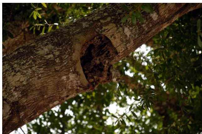
Figure 4. Void in tree branch.