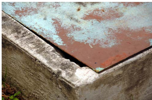
Figure 6. Crack in cement that creates opening.

Although this type of nesting site may be the first choice for the bees, they certainly will nest at many other locations. Some of these locations are difficult to bee-proof; therefore, it is important that regular inspections are done to monitor for any bee activity. Examine the following pictures as a reference point for your inspections. They include examples of places that are difficult to bee-proof.