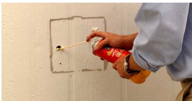
Figure 21. Foaming holes in side of building.

Foam: Expanding/insulating foam sealant is best for sealing off holes/cracks in walls. If foam is exposed to weather, be sure to paint the exposed surface to prevent cracking or eroding of foam.