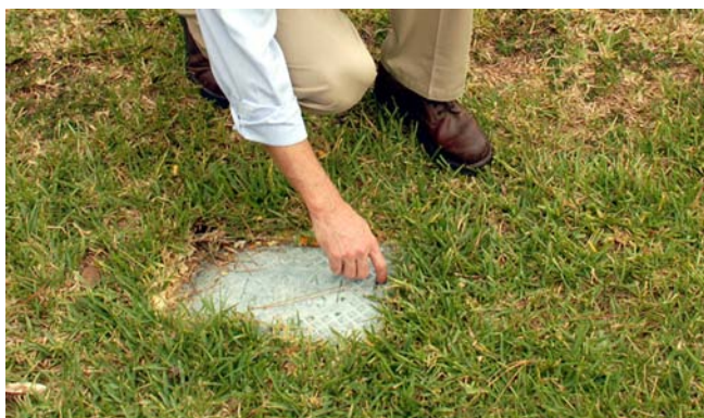
Figure 1. Closed water meter.

favor as a nesting site? AHBs, especially, have been known to nest almost anywhere, yet all honey bees favor certain sites over others. Sites that are potentially attractive to honey bee colonies consist of a small opening that accesses an open, shaded area. Examples are water meters, manholes, holes in a structure that lead to open space inside a wall, gutter down-spouts, pipes, etc. Examine these photos as a reference.