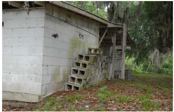
Figure 10. Cinderblocks.