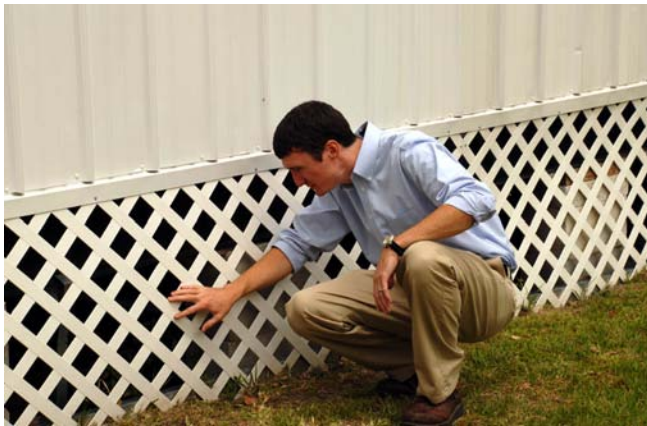
Figure 8. Inspecting under house.