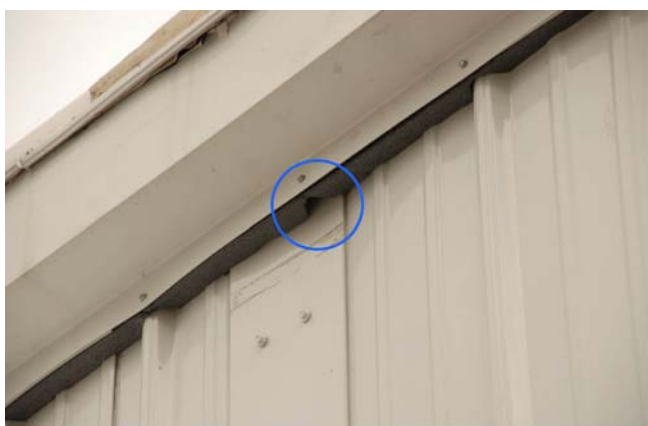
Figure 3. Small hole in siding.