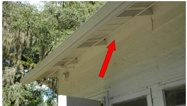
Figure 11. Under eave of house.