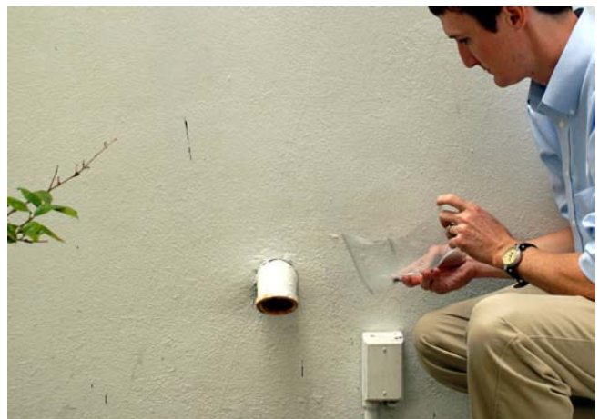
Figure 19. Placing screening over pipe.

greater. Also, latex concrete-crack filler can be used to seal cracks and crevices in cinderblock or concrete surfaces.