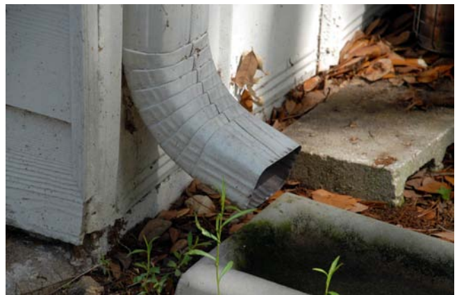
Figure 18. Gutter downspout.