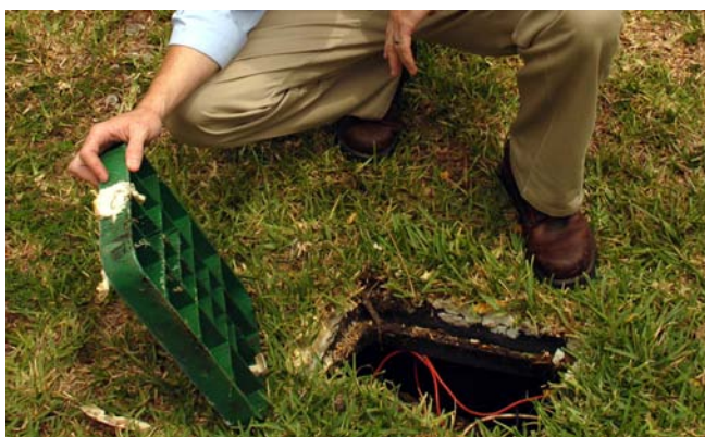
Figure 2. Open water meter.