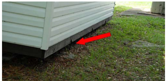
Figure 12. Opening under shed.

vehicles, empty containers, fence posts, lumber piles, utility infrastructures, old tires, tree branches, garages, outbuildings, sheds, walls, chimneys, playground equipment, etc.