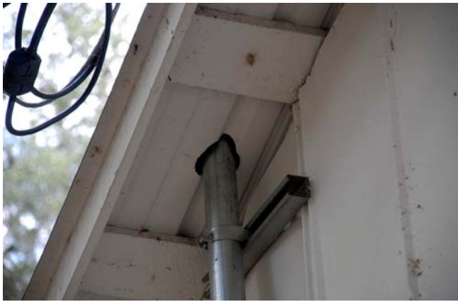
Figure 14. Opening around pipe.