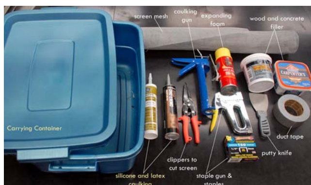
Figure 22. Bee-proofing tools.

Equipment list: silicone and latex caulking, caulking gun, roll of screen mesh, clippers to cut screen, staple gun, staples, wood filler, concrete filler, putty knife, duct tape, expanding foam, and carrying container.