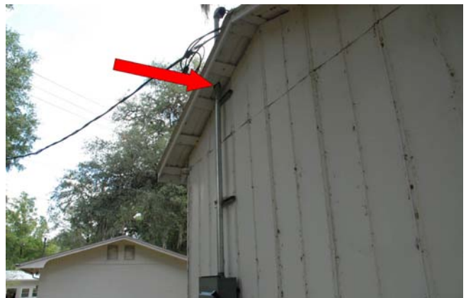
Figure 13. Opening around pipe.

Once an initial inspection reveals what the potential nesting sites might be, the next step is to