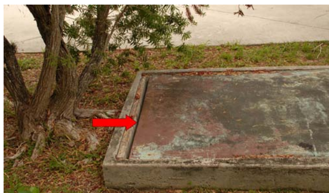
Figure 5. Open space in metal drain cover.