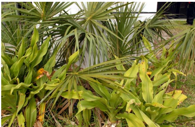
Figure 9. Dense shrubs and bushes.