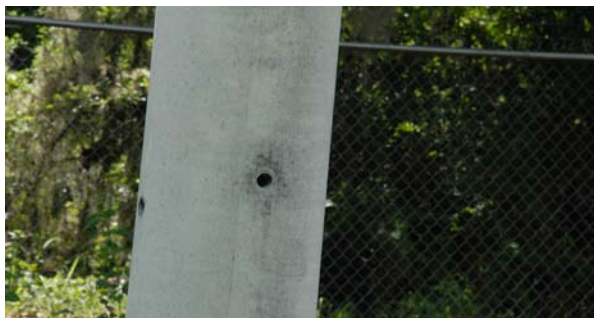
Figure 16. Small hole in light pole.

block-off or remove those sites. This can be done using several methods.