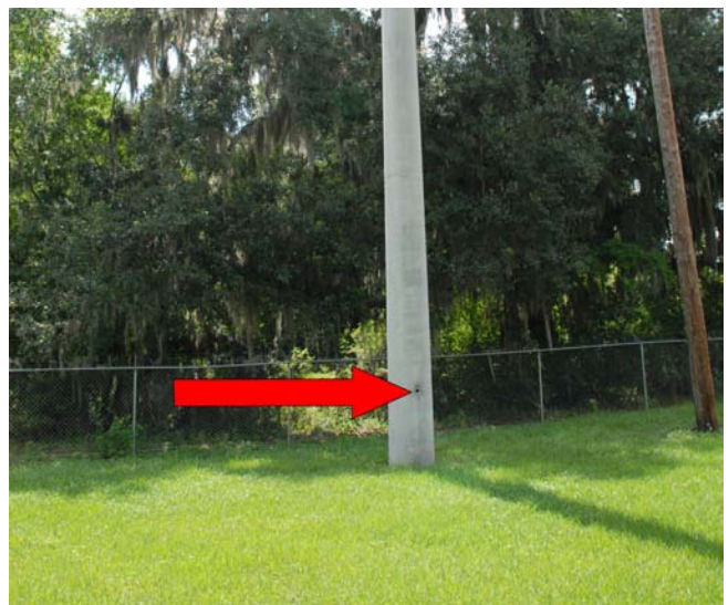
Figure 17. Small hole in light pole.

Caulking: Use 100% silicone caulking to seal cracks, crevices, or other voids 1/8 th of an inch or