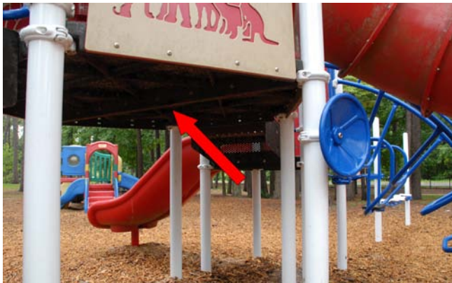
Figure 15. Under playground equipment.