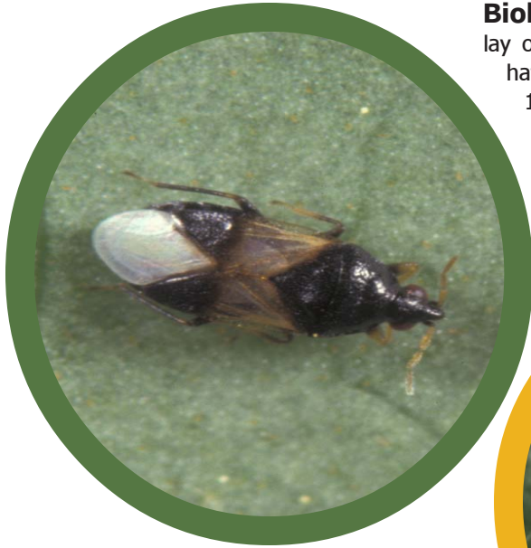
Figure 1. Adult minute pirate bug.