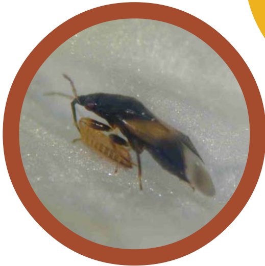
Figure 3. Adult Orius insidiosus preying on an adult thrips.