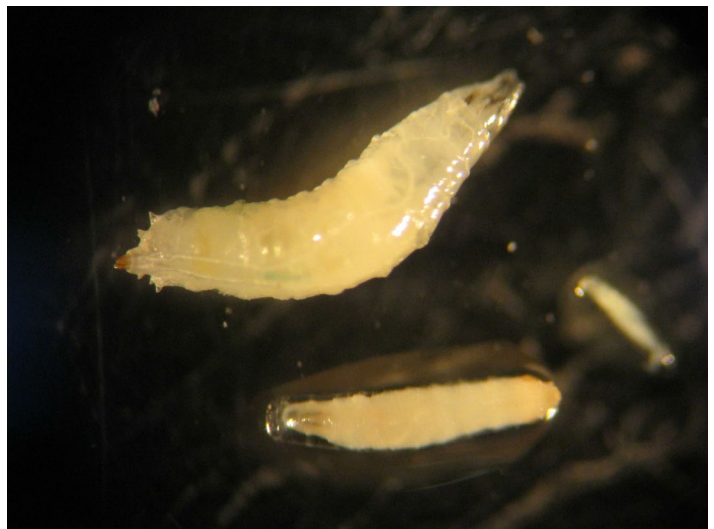
Figure 5. SWD larval instars. Clockwise from right, first, second, and third instars.

SWD have been shown to have as many as 15 generations per year when observed in captivity (Kanzawa 1935). These flies can complete their lifecycle in 21 to 25 days and can live for up to 66 days (Kanzawa 1939). The female SWD lays 1 to 3 eggs per oviposition site, with an average of 380 eggs throughout her lifetime. Multiple female SWD can lay