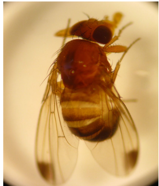
Figure 1. Male SWD.

The spotted wing drosophila is in the family Drosophilidae, also known as the vinegar, fruit, or pomace flies. It shares many physical characteristics with the common vinegar fly, Drosophila melanogaster , which frequents over-ripe and damaged fruits. SWDs have rounded abdomens that are pale yellow to light brown and have dark brown, unbroken horizontal stripes on the dorsal side. They have large, red eyes and sponging mouthparts with which they soak up their food.