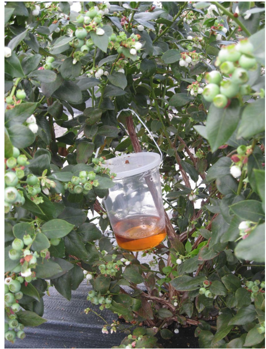
Figure 7. Trap hung in shady interior of a blueberry bush.

used to hang the trap in the center of the bush in the shade. Some trap designs include a yellow sticky card inside the trap; we have found that captures do not increase with the addition of the card.