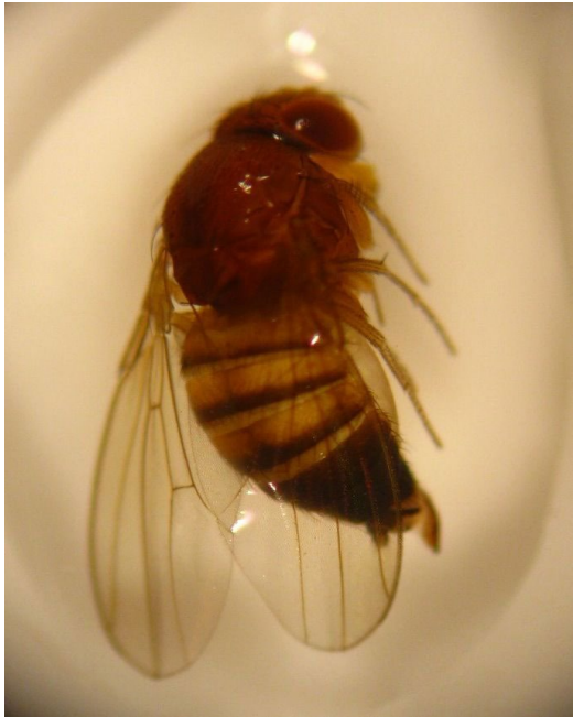
Figure 2. Female SWD.

on the forelegs, one on the first tarsal segment and one on the second, whereas D. biarmipes has both rows of spines on the first tarsal segment (Hauser 2011). A hand lens will reveal these spines, which appear as two black horizontal stripes on the forelegs (Fig. 3). Females can be distinguished by comparing the ovipositors.