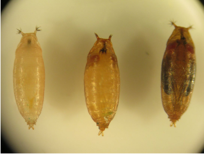
Figure 6. Three pupal instars. From left, first, second, and third instars.

SWD pupae are oblong and range from light brown to dark brown as they develop (Fig. 6). Spiked protrusions on the anterior end of the pupae are used as breathing apparatuses. As the pupae get closer to eclosion, or emergence, the red eyes and wings of the fly can be seen through the pupal case. Pupation can occur in the soil, inside the fruit, or on the surface of the fruit. It generally occurs within 4 to 5 days (Kanzawa 1935).