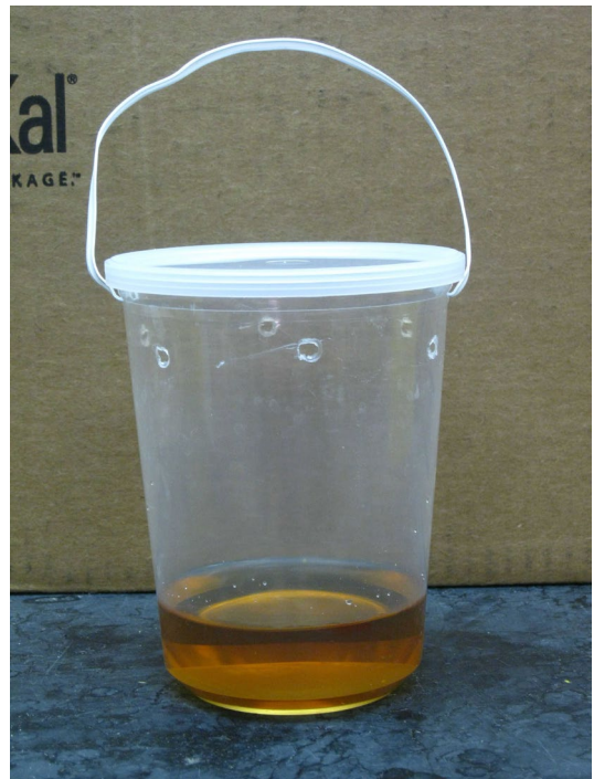
Figure 8. Plastic cup trap with 8 to 10 ¼-in holes and a lid. Trap baited with apple cider vinegar.

The trap recommended for SWD monitoring is a plastic cup trap made from a 32 oz plastic cup and lid with 8 to 10 ¼-inch holes along the upper rim (Fig. 8). A twist tie is