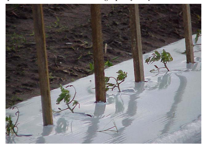
Figure 22. Wind can desiccate plants and wind-blown sand can abrade young seedlings, causing loss of foliage and crop delay or even death. Tomato stakes can actually help protect young plants if wind is blowing down the row instead of across the row.