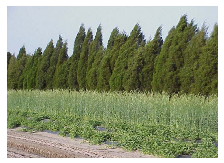
Figure 21. Here, rye is planted as a temporary windbreak on ditch rows within the field and southern red cedar is planted on individual field borders as a permanent windbreak.