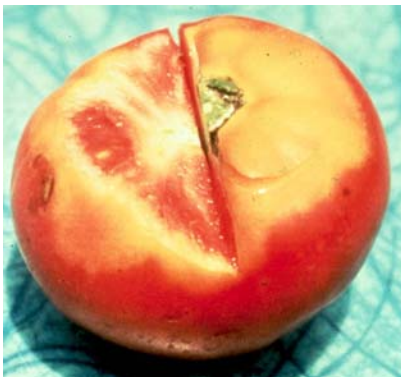
Sub lethal scalding