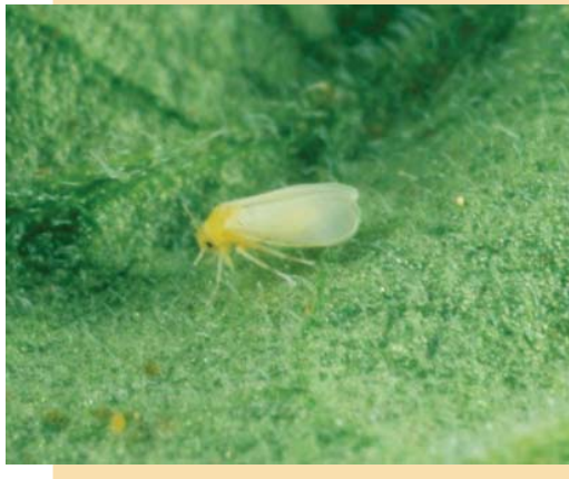
Figure 2. Whitefly adults should be collected when sampling.

For additional information on biology and control information, a good source is Dr. Lance Osborne's website at http://www.mrec.ifas.ufl.edu/LSO/bemisia/bemisia.htm. It includes a number of documents that contain information from Florida and other states.