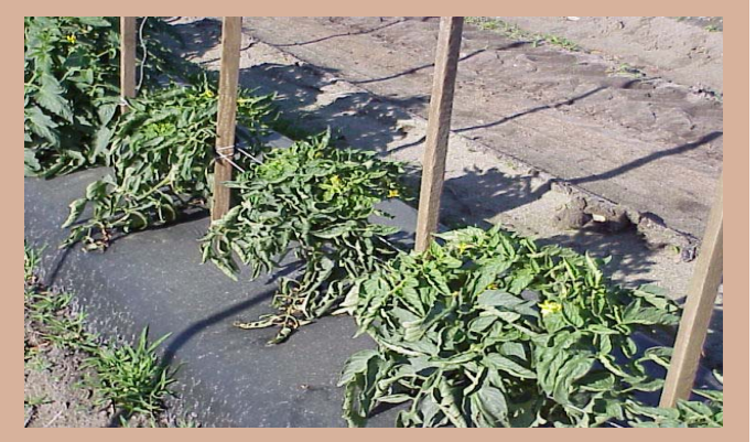
Figure 6. TYLC symptoms on tomatoes in central Florida.