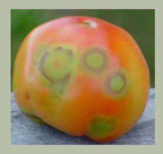
Figures 7 & 8 . TSW damage on green and ripe fruit in north Florida.