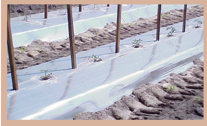
Figure 5. Metalized VIF mulch covering tomato beds in central Florida.

In the spring crop of 2000 in North Florida on a large scale grower trial (40 acres metalized and 100 acres black), use of metalized mulch reduced incidence of TSWV from 45% to 11%. In 2002 in another grower trial (100 acres metalized and 25 acres on black), the combination of Actigard® and metalized mulch reduced TSW from 23% to 3%. Other growers report reduction in virus of up to 75% with increased profits of up to $4000 per acre.