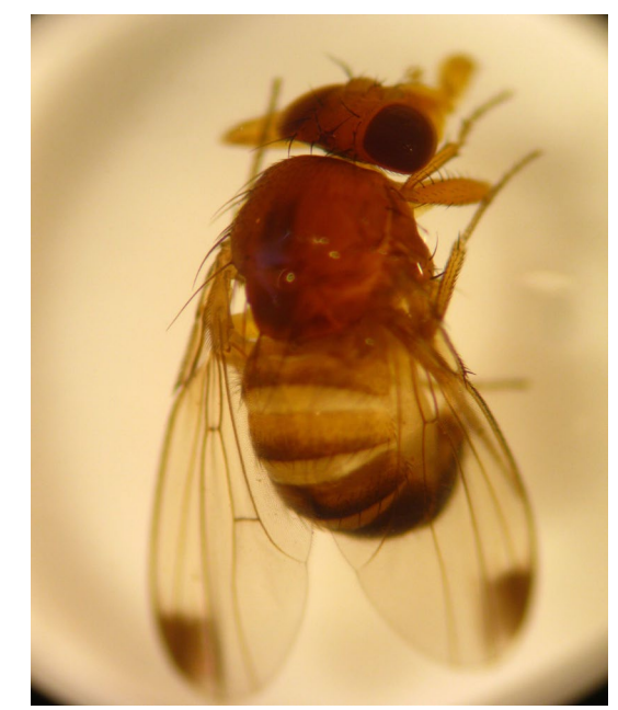
Figure 1. Male SWD.

The spotted wing drosophila is in the family Drosophilidae, also known as the vinegar, fruit, or pomace flies. It shares many physical characteristics with the common vinegar fly, Drosophila melanogaster , which frequents over-ripe and damaged fruits. SWDs have rounded abdomens that are pale yellow to light brown and have dark brown, unbroken horizontal stripes on the dorsal side. They have large, red eyes and sponging mouthparts with which they soak up their food.