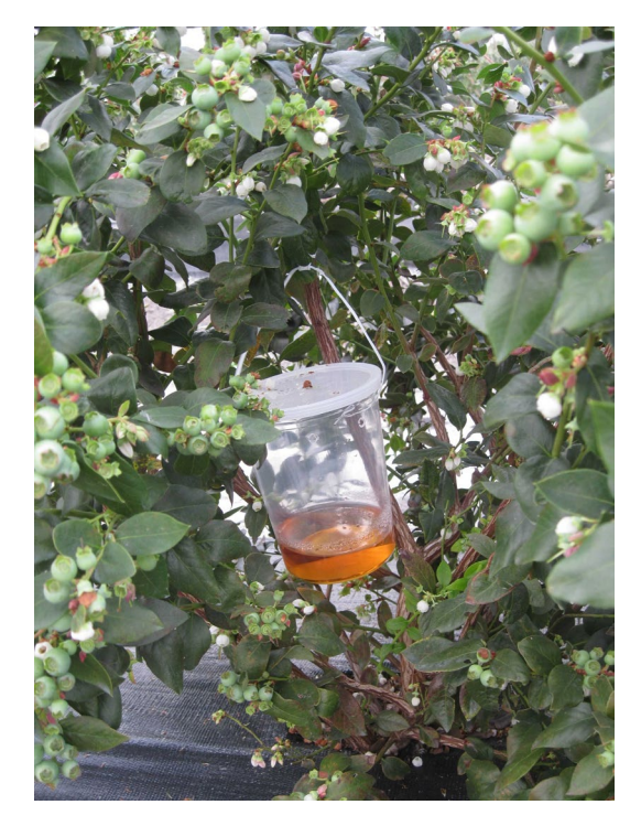
Figure 7. Trap hung in shady interior of a blueberry bush.

used to hang the trap in the center of the bush in the shade. Some trap designs include a yellow sticky card inside the trap; we have found that captures do not increase with the addition of the card.