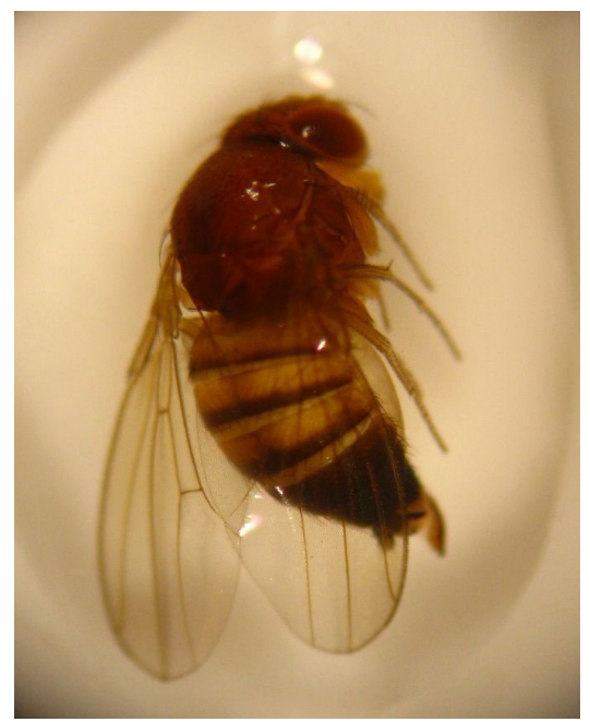
Figure 2. Female SWD. Credits: L. E. Iglesias

on the forelegs, one on the first tarsal segment and one on the second, whereas D. biarmipes has both rows of spines on the first tarsal segment (Hauser 2011). A hand lens will reveal these spines, which appear as two black horizontal stripes on the forelegs (Fig. 3). Females can be distinguished by comparing the ovipositors.