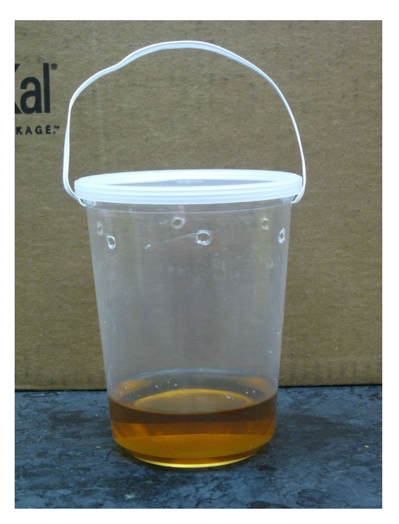
Figure 8. Plastic cup trap with 8 to 10 1/4-in holes and a lid. Trap baited with apple cider vinegar.

The trap recommended for SWD monitoring is a plastic cup trap made from a 32 oz plastic cup and lid with 8 to 10 ¼-inch holes along the upper rim (Fig. 8). A twist tie is