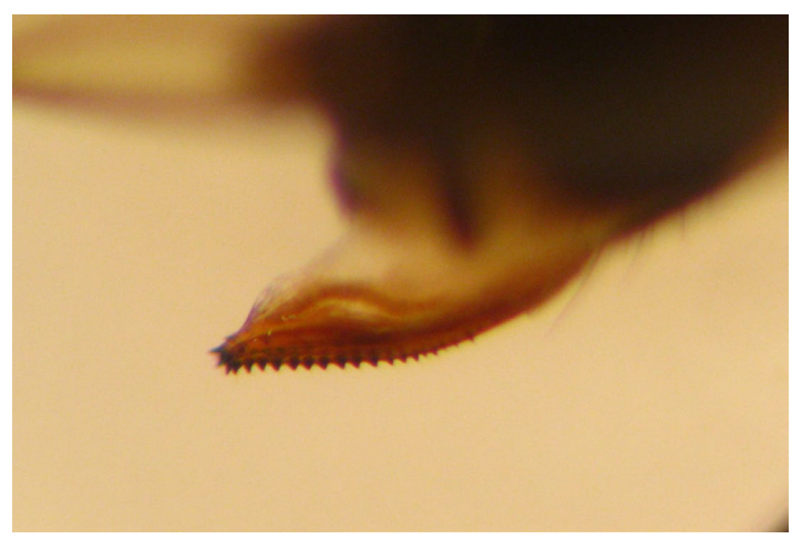
Figure 4. Female SWD ovipositor is dark with well-developed teeth.

SWD have been shown to have as many as 15 generations per year when observed in captivity (Kanzawa 1935). These flies can complete their lifecycle in 21 to 25 days and can live for up to 66 days (Kanzawa 1939). The female SWD lays 1 to 3 eggs per oviposition site, with an average of 380 eggs throughout her lifetime. Multiple female SWD can lay