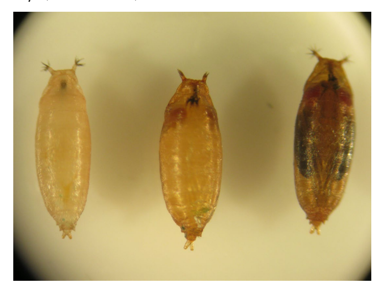
Figure 6. Three pupal instars. From left, first, second, and third instars.

SWD pupae are oblong and range from light brown to dark brown as they develop (Fig. 6). Spiked protrusions on the anterior end of the pupae are used as breathing apparatuses. As the pupae get closer to eclosion, or emergence, the red eyes and wings of the fly can be seen through the pupal case. Pupation can occur in the soil, inside the fruit, or on the surface of the fruit. It generally occurs within 4 to 5 days (Kanzawa 1935).