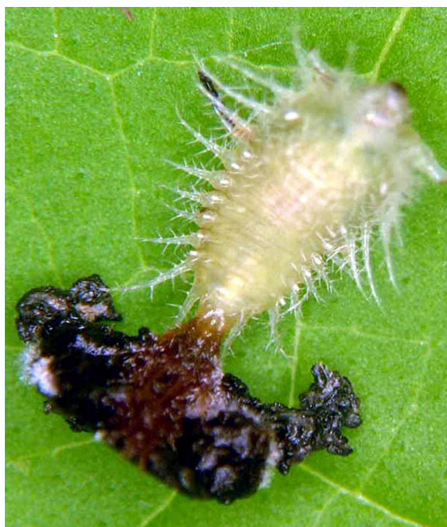
Figure 2. Larva of Gratiana boliviana .

The life cycle of G. boliviana begins when females deposit eggs individually on tropical soda apple leaves and petioles. Females produce an average of 300 eggs. The egg stage lasts 5-6 days at 25°C. The larval stage is completed in 15-18 days, and there are five instars. The pupa stage usually lasts 6-7 days. In total, 26 to 31 days are required for the insect to develop from the egg to the adult stage.