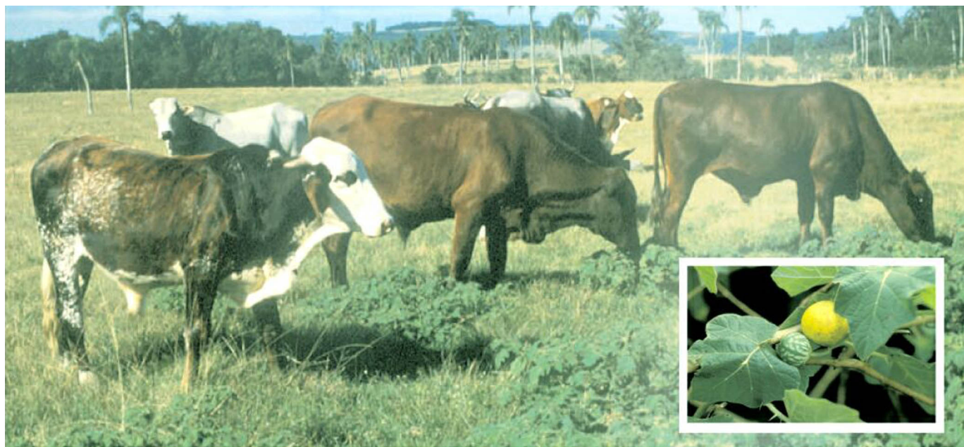
Figure 1. Cattle feeding on tropical soda apple fruits.

then more than 220,000 beetles have been released in 39 counties in Florida, 3 counties in Georgia, 2 counties in Alabama, and 1 county in Texas. The beetles have established at all sites in Central Florida where they have been released since 2003. They are causing extensive defoliation on tropical soda apple (20-100%), and are spreading from 1 to 10 miles/year from the initial release sites. Six years post-release, no nontarget effects have been observed on closely related plants growing in close proximity to tropical soda apple.