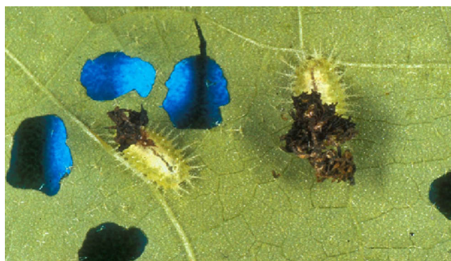
Figure 5. Larvae of Gratiana graminea .