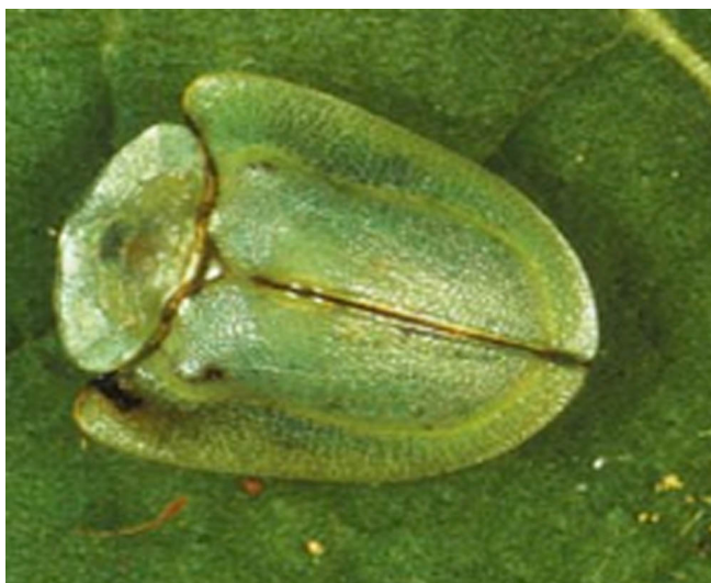
Figure 6. Adult of Metriona elatior .

areas or under shady conditions contrary to G. boliviana that prefers semi-shady to sunny conditions.