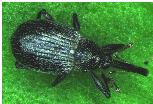
Figure 8. Adult flower-bud weevil Anthonomus tenebrosus .