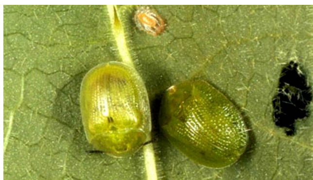
Figure 4. Adults of Gratiana graminea .

Females produce from 112 to 325 eggs during a period of 3 to 4 months. Eggs are laid individually on tropical soda apple leaves and petioles. Larvae undergo five instars and it may take from 14 to 20 days to reach the pupa stage, which lasts from 6 to 9 days attached by the last abdominal segment to the underside of the leaf. At least 4 to 6 generations/year can occur under optimum environmental conditions.