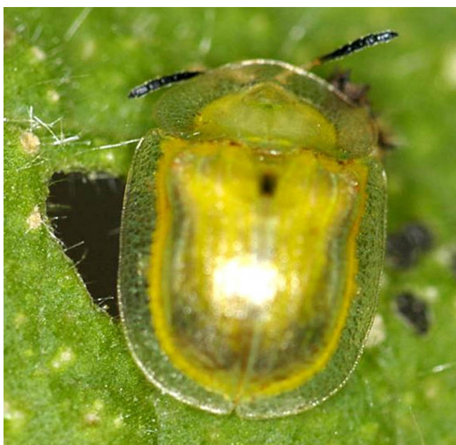
Figure 3. Adult of Gratiana boliviana.

FLDACS-DPI quarantine facility in Gainesville, FL, and an open field risk assessment with solanaceous crops was concluded at the Universidade Regional de Blumenau, Santa Catarina state, Brazil, in June 2006. A request for field release was submitted in August 2006 to UF/IFAS for internal review and it was submitted to the Technical Advisory Group (TAG) for Biological Control Agents of Weeds in October 2006. Field release of this insect in Florida is anticipated in the summer-fall of 2010.