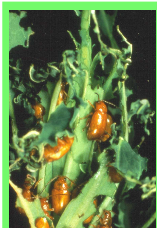
The leafy spurge flea beetle is one of a number of agents introduced to control this rangeland pest.