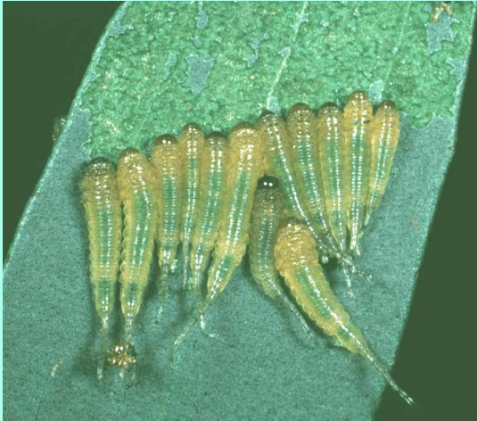
Insects imported from Australia feed on the leaves of the Melaleuca tree. Combined with other agents, there is hope that Melaleuca trees can be controlled.

In ancient times, the Chinese discovered that increasing ant populations in their citrus groves helped decrease destructive populations of large boring beetles and caterpillars. That use of a natural enemy to control a pest marked the birth of biological control.