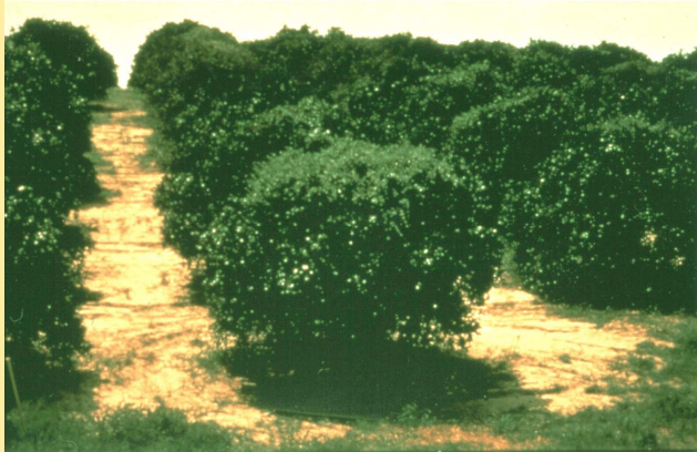
Stranglevine grows on top of citrus trees and limits their productivity. DeVine® is a fungus-based product that controls this weed for years with one application.