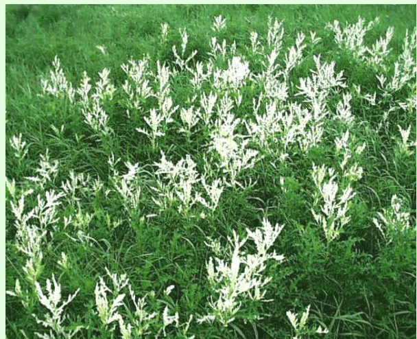
Canada thistle is native to Eurasia. Those pictured here are being attacked by a bacterium. Research trials offer hope that this invasive weed can be controlled with this organism.