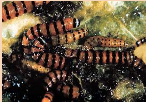
Caterpillars of the moth Cactoblastis cactorum bore into the pads of prickly pear. This damages the cactus and introduces a bacterium that causes the plant to die.

Biological control research and implementation is even more relevant today. Foreign and native organisms that attack weeds are being evaluated for use as biological control agents. As a weed management method, biological control offers an environmentally friendly approach that complements conventional methods. It helps meet the need for new weed management strategies since some weeds have become resistant to certain herbicides. Biological control agents target specific weeds. Moreover, this technology is safe for applicators and consumers.