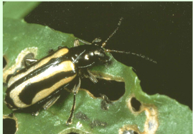
The alligatorweed fleabeetle is one of a complex of insects that successfully controls this floating aquatic weed.

It is well demonstrated that weeds can be controlled biologically. Deleterious rhizobacteria have been used to stunt weed growth in wheat fields in the Pacific Northwest. A rust fungus has been used to eliminate rush skeletonweed from thousands of acres of rangeland in the West. A complex of introduced insects has also cleared alligatorweed from waterways, rice fields and lakes in the South.