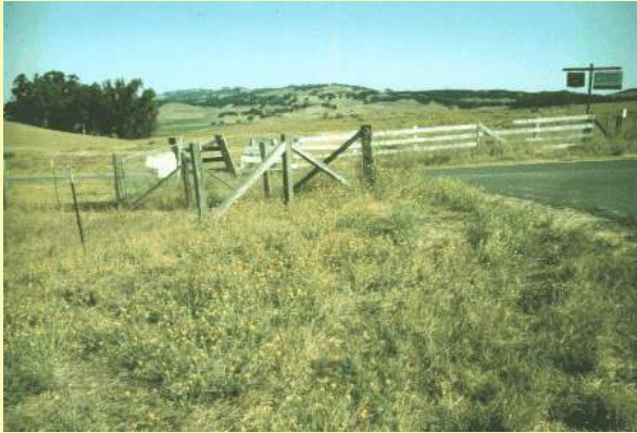
Yellow starthistle infests millions of acres in the western U.S. It out-competes native grasses and forbs, reducing grazing quality, and its sharp thorns injure livestock.