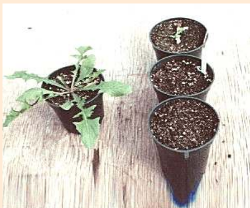
Two applications of a bacterial pathogen of Canada thistle completely controlled dandelion (pots on the right) in greenhouse trials.

The cost of developing and conducting a biological control program varies with the target weed and the strategy selected. On average, a biological control program will cost about $4 million. But every dollar spent in development returns at least $50 in benefit.