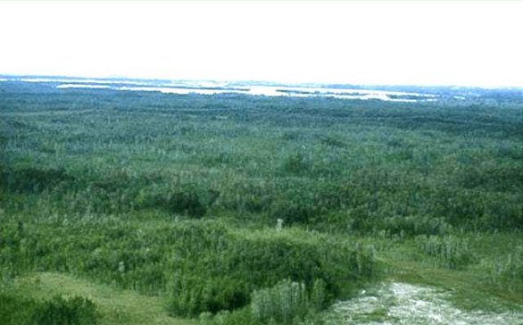
Melaleuca spreads over hundreds of thousands of acres in the Everglades, one of the most fragile ecosystems in the continental U.S.