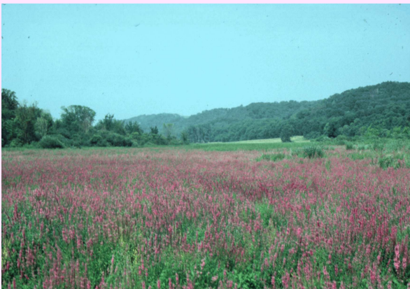
This purple loosestrife, growing in Minnesota, can be controlled with insects introduced from Europe.