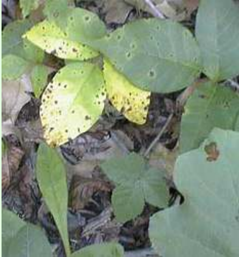
This poison ivy plant is infected with a fungus. Scientists are evaluating several strains of fungi as biological control agents of this troublesome weed.

Some bacteria and fungi applied as biological control agents do not survive from year to year. These organisms must be applied on an annual basis. This technique is called the " bioherbicide " strategy. With this tactic, biological agents are used in a manner similar to chemical herbicides.