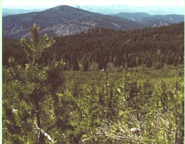
These lodgepole pine saplings have been released from competition with sitka alder by applications of the fungus Chondrostereum purpureum .

With public support, solutions to weed control problems can be achieved. But we should all understand also that how soon biological solutions to weed control are available is a function of the amount of financial support that the research receives. When used in an integrated approach, property owners and farmers will benefit from this method of weed management.